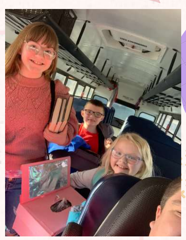
"They took it upon themselves to pickup all the trash on the bus . . . "