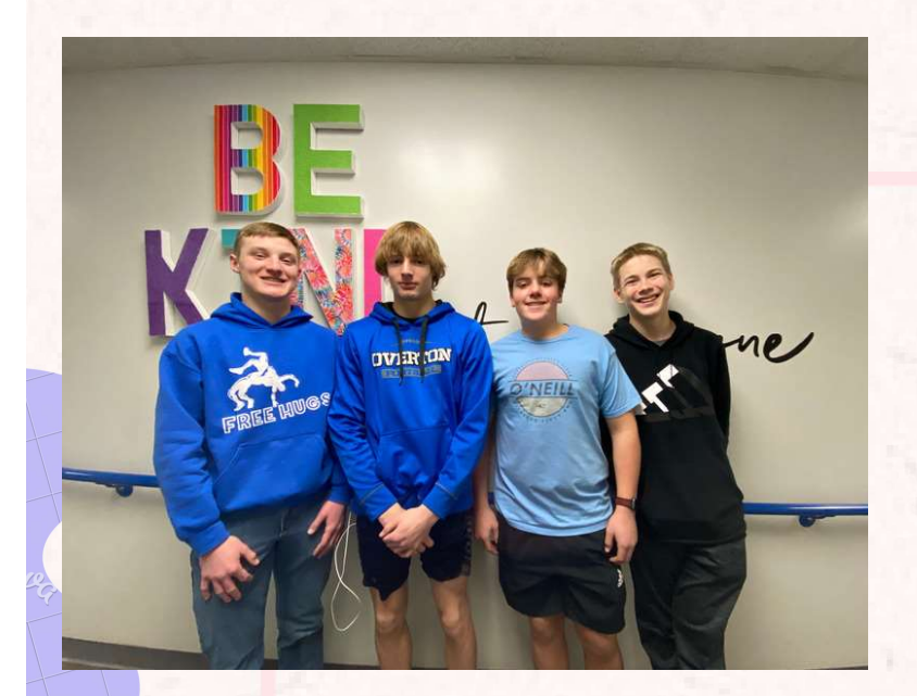
"Willing helpers at lunch by washing the tables . . . "