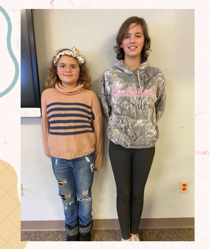
"Helped the preschoolers at lunch forThoughtful Thursday!"